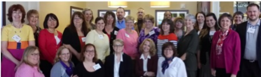
Members of the BCEN, MSNCB, and Kar Associates, Inc. certification advocacy groups at the workshop.